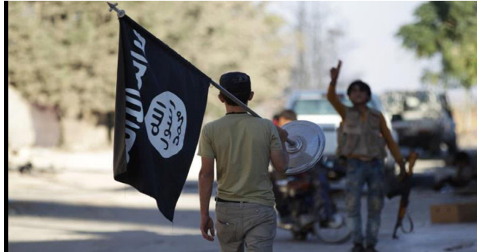
Islamic State Khorasan Province (ISKP)

on how the religious minorities took the impact. The main target of the attackers seem to be another set of minorities, Shias, who suffered the most casualties as the bomb exploded outside a religious seminary. The Islamic State or Daesh took responsibility for the attack. It occurred in the volatile Orakzai agency, and it was neither the first nor the last terrorist activity recorded there. But, the 2018 blast case gives a better understanding of the gene material and behaviour of the current Islamic State Khorasan Province (ISKP), that is wreaking havoc in the neighbouring Afghanistan. [3]