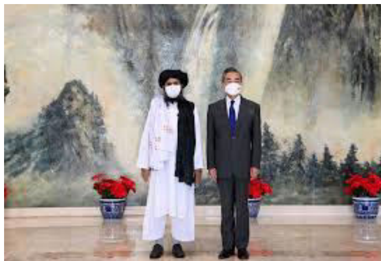
The fall of Afghanistan and its implications for China

Notably, it is very difficult to trust the Taliban when looking back on its past support to al-Qaeda and its abysmal record of human rights violations. Additionally, the manner in which the Taliban seized control at gunpoint does not illustrate any distinct change in the organization's character. Significantly, the international community needs to monitor the activity and the pledges made by the Taliban leaders for the basic rights and security of the Afghan people. The Taliban must be made to "walk the talk" and not just "talk the talk" in terms of adhering to international norms and laws. [9]